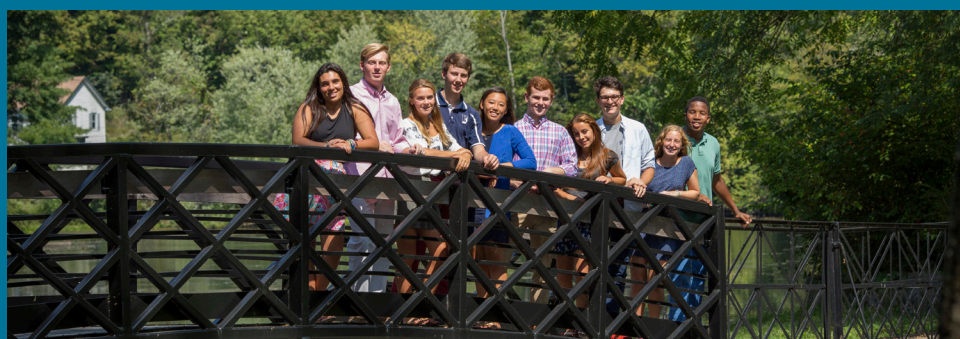
2015-2016 Senior Class Council