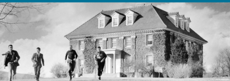
West Hall, circa 1940s