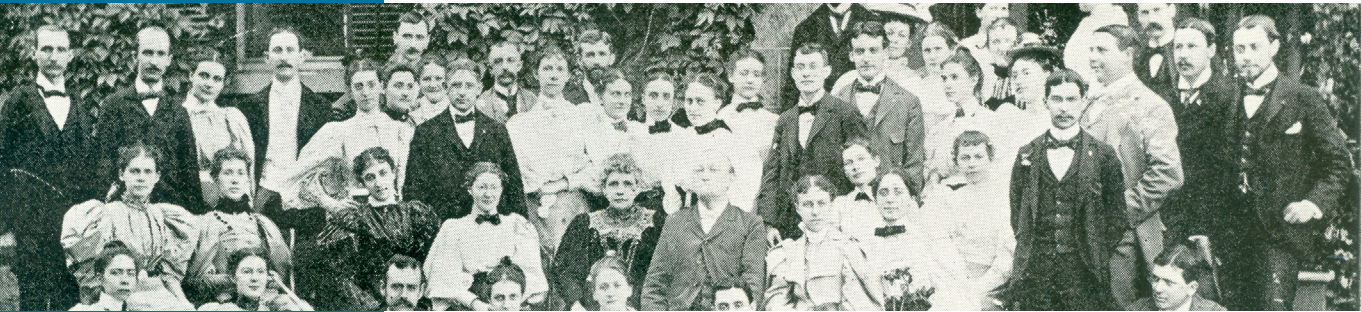
1896: The 10th Reunion of the Class of 1886